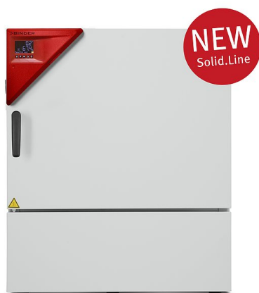
Model KBF-S 115